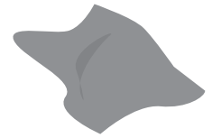
Scotch-Brite Cloth (or fine sandpaper)